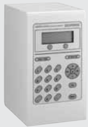
Sequence Controller AST 10-1