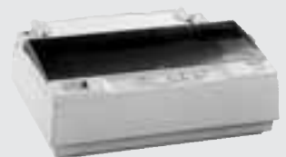
Printer ND 100